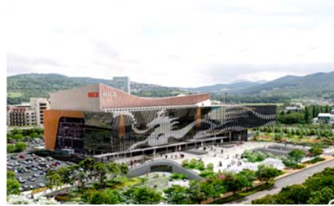
Night view of Gyeongju and HICO