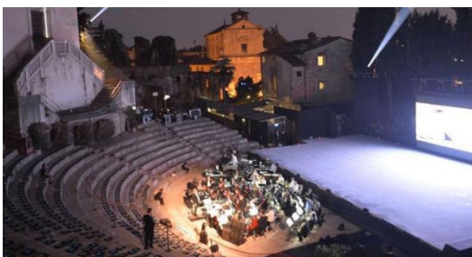
Teatro Romano during a performance