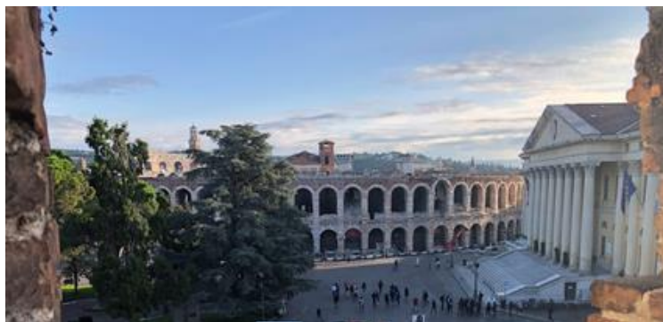
View of Arena and Piazza Bra from the Palazzo Gran Guardia

Tel. +39 0532 735618 (Mon to Fri 9.00-13.00)