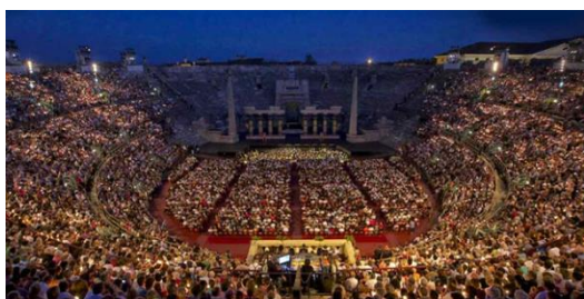
Arena during a performance