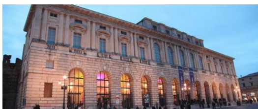
Palazzo Gran Guardia